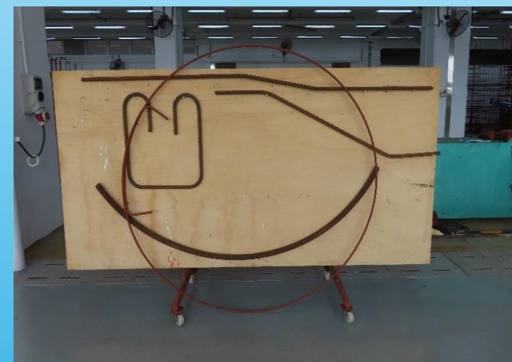
卷C : 25%剪屈鋼筋及75%綁紮圓、方籠鋼筋結構 Paper C: 25% Bar Cutting and Bending and 75% Bored Pile and Diaphragm Wall Bar Fixing