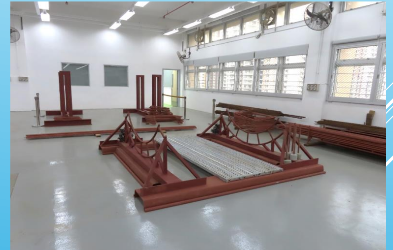
卷C：25%剪屈鋼筋及75%綁紮圓、方籠鋼筋結構 Paper C: 25% Bar Cutting and Bending and 75% Bored Pile and Diaphragm Wall Bar Fixing