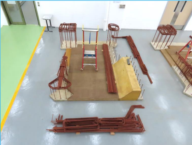
卷A：25%剪屈鋼筋及75%綁紮樓廠鋼筋結構 Paper A: 25% Bar Cutting and Bending and 75% Superstructure Bar Fixing