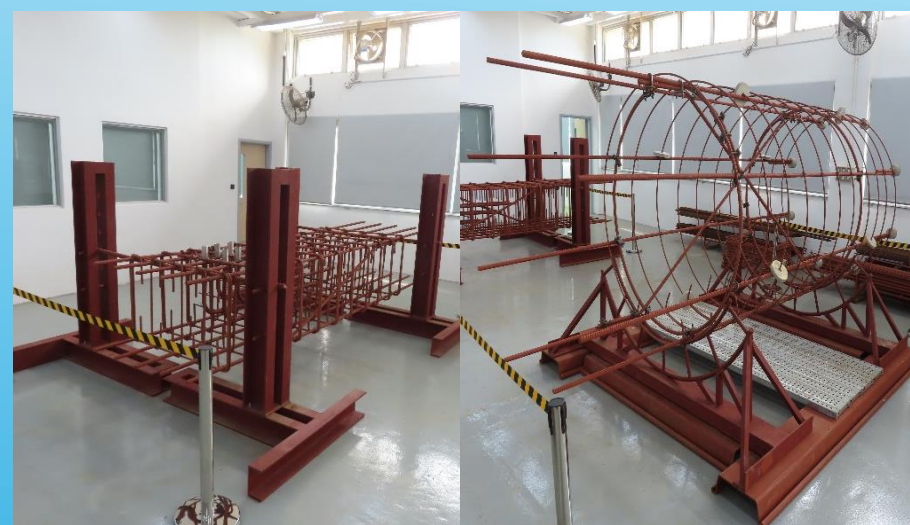
卷C：25%剪屈鋼筋及75%綁紮圓、方籠鋼筋結構 Paper C: 25% Bar Cutting and Bending and 75% Bored Pile and Diaphragm Wall Bar Fixing