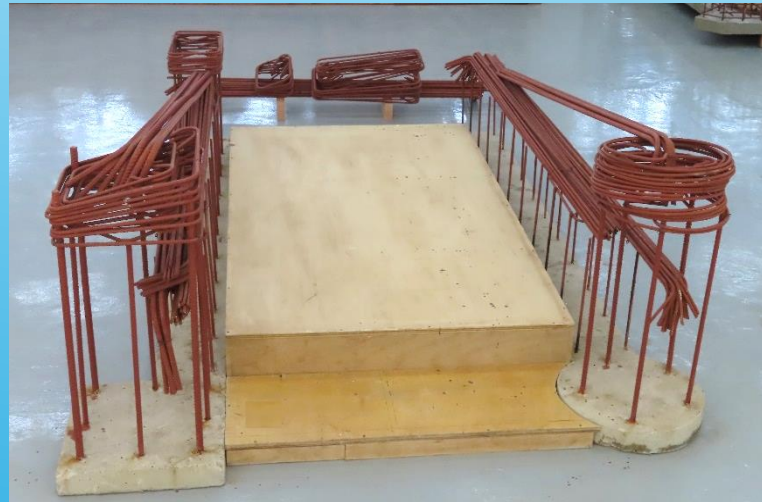
卷B：50%剪屈鋼筋及50%綁紮樓廠鋼筋結構 Paper B: 50% Bar Cutting and Bending and 50% Superstructure Bar Fixing