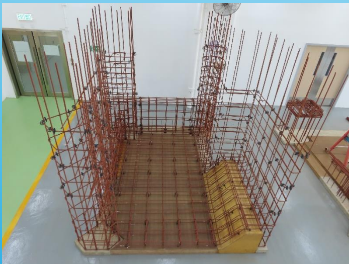
卷A：25%剪屈鋼筋及75%綁紮樓廠鋼筋結構 Paper A: 25% Bar Cutting and Bending and 75% Superstructure Bar Fixing