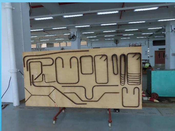
卷B : 50%剪屈鋼筋及50%綁紮樓廠鋼筋結構 Paper B: 50% Bar Cutting and Bending and 50% Superstructure Bar Fixing