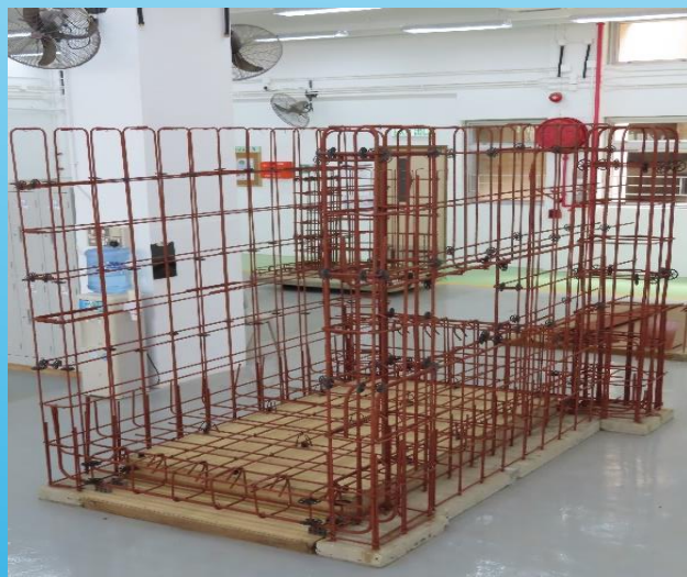
卷B：50%剪屈鋼筋及50%綁紮樓廠鋼筋結構 Paper B: 50% Bar Cutting and Bending and 50% Superstructure Bar Fixing