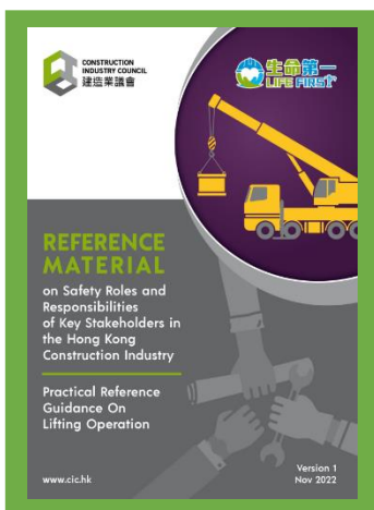
Reference Material on Safety Roles and Responsibilities of Key Stakeholders in the Hong Kong Construction Industry (Practical Reference Guidance On Lifting Operation)