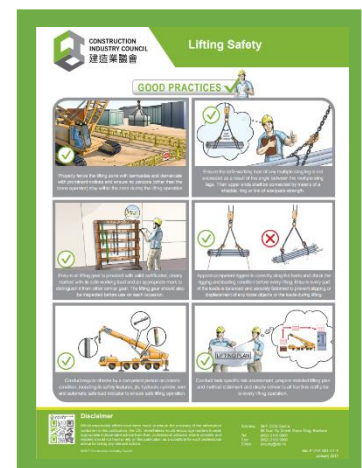
Poster - Lifting Safety