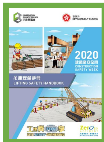
Lifting Safety Handbook