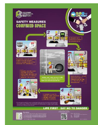
Poster on Safety Measures - Confined Space