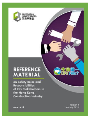
Reference Material on Safety Roles and Responsibilities of Key Stakeholders in the Hong Kong Construction Industry