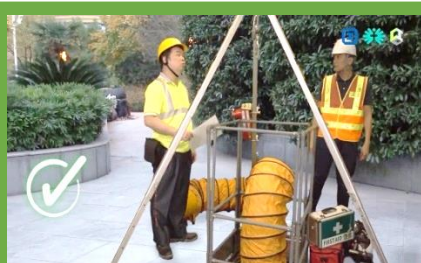
Please refer to the Safety Video – Confined Space Works at CIC website