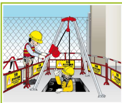
A worker should use suitable safety harness connected to a lifeline that is strong enough to enable him to be pulled out