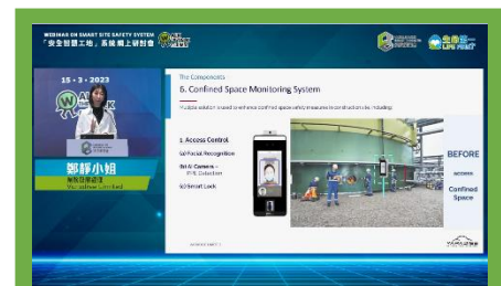
Life First – Walk the Talk – Smart Site Safety System was held on 15 Mar 2023. Please watch replay of the Webinar at CIC website