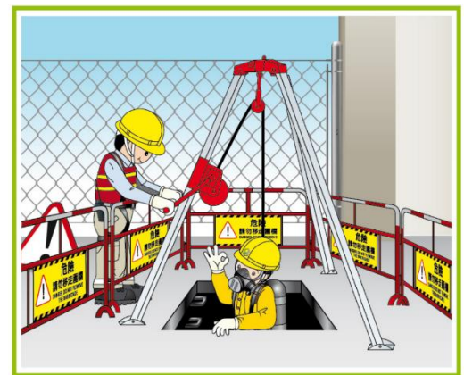
Workers should use suitable safety harness connected to a lifeline that is strong enough to enable him to be pulled out