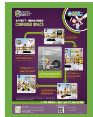
Poster Safety Measures-Confined Space