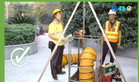
Please refer to the Safety Video - Confined Space Works in the CIC website