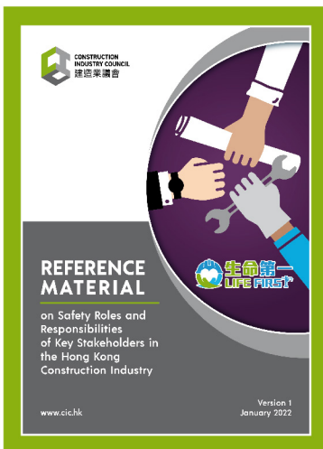
Reference Material on Safety Roles and Responsibilities of Key Stakeholders in the Hong Kong Construction Industry