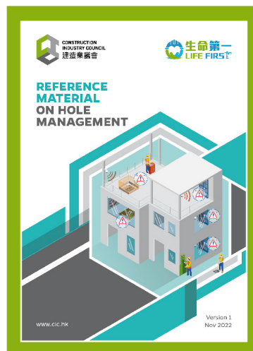
Reference Material on Hole Management