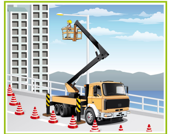
Use of appropriate working platform as far as possible.

The above recommendations have only listed out key points. For more information on the relevant safety measures, please make reference to the 《Construction Site (Safety) Regulations》 issued by the Labour Department, the 《Code of Practice for the Lighting, Signing and Guarding of Road Works》 issued by the Highways Department, and the 《Safety Alert No. 003/16 - Road Maintenance Works Safety》 issued by the Construction Industry Council.