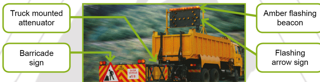
Figure 1: A shadow vehicle