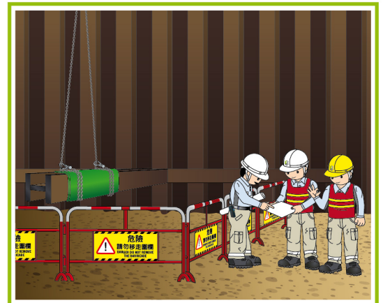
Ensure the alteration / dismantling works are carried out according to method statement and safety procedures.

The above only listed out key points of safety, for more information please make reference to the Construction Sites (Safety) Regulations , the Safe System of Work and 5 Steps to Risk Assessment issued by the Labour Department.