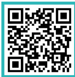
Certificate In Repair, Maintenance, Alteration and Addition (Electrical And Mechanical)