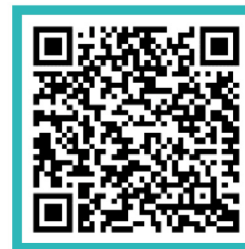
Repair, Maintenance, Alterations and Additions (Building Construction) & Repair, Maintenance, Alterations and Additions (Electrical and Mechanical)