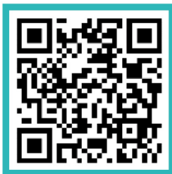
Certificate In Repair, Maintenance, Alteration and Addition (Building Construction)