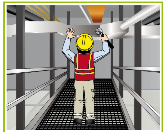
Working Platform for Maintenance

The above only listed out key points of safety, for more information please make reference to the 《Construction Site (Safety) Regulations》, the 《Guidance Notes on Classification and Use of Safety Belts and their Anchorage Systems》 issued by the Labour Department and 《Work-at-Height Safety Handbook》 issued by the CIC.