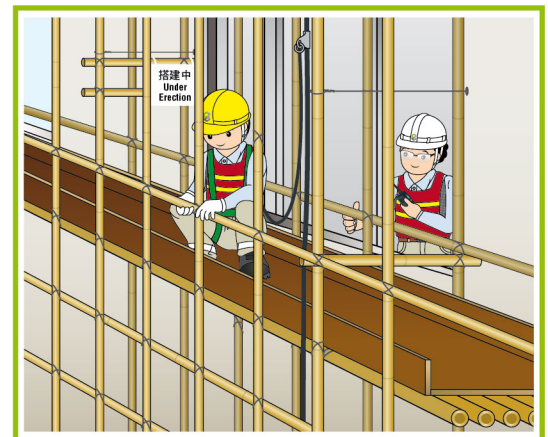
Under supervision of competent person