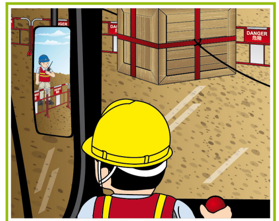
Operator has clear vision.