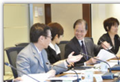
Promotional video broadcasted on TVB channels 於無綫電視播出之宣傳片

24 Produced four promotional videos 推出四輯推廣議會之宣傳片