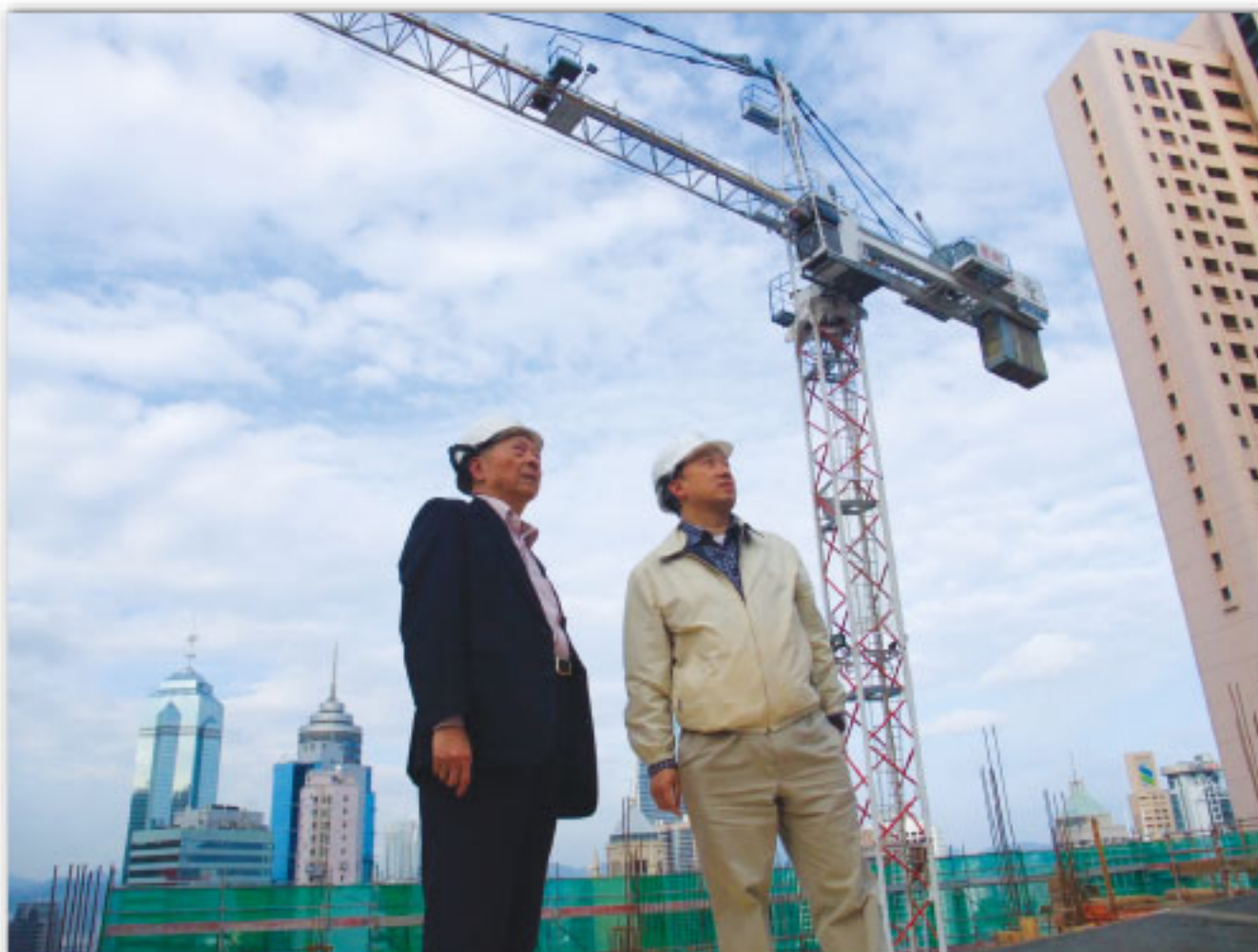
Construction Practitioners are devoted to building Hong Kong a better city. 建設美好香港是建造業從業員的共同願景及使命。

各界人士可透過香港電台網頁 http://programme.rthk.hk 觀看各集內容。