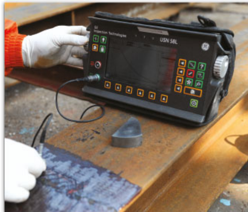
Nondestructive test on welds 焊縫無損性測試

services of acceptable quality are provided not only in the laboratory, but also at construction sites where much work relied on the site operators. HKAS had issued some additional requirements to strengthen the site supervision and tighten the control in construction materials testing. These additional requirements addressing the high risk areas had been developed by HKAS through