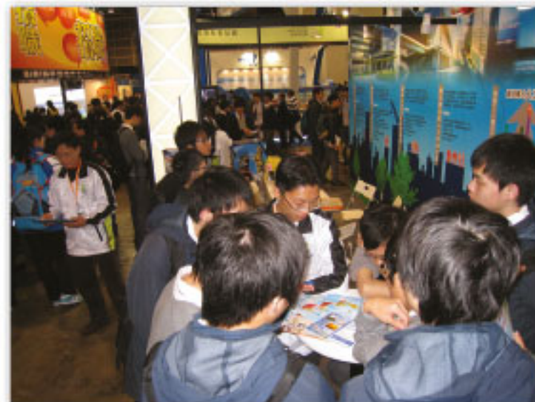
Students listened attentively to programme highlights. 學生留心聆聽課程特色介紹