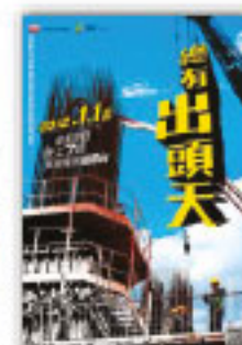
RTHK documentary episodes "A Dream Come True" 於香港電台推出之片集「總有出頭天」

26 Sponsorship to industry events 贊助業界活動