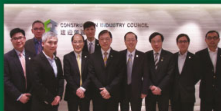
Group photo of HKICM representatives and CIC representatives. 香港營造師學會代表與議會代表合照