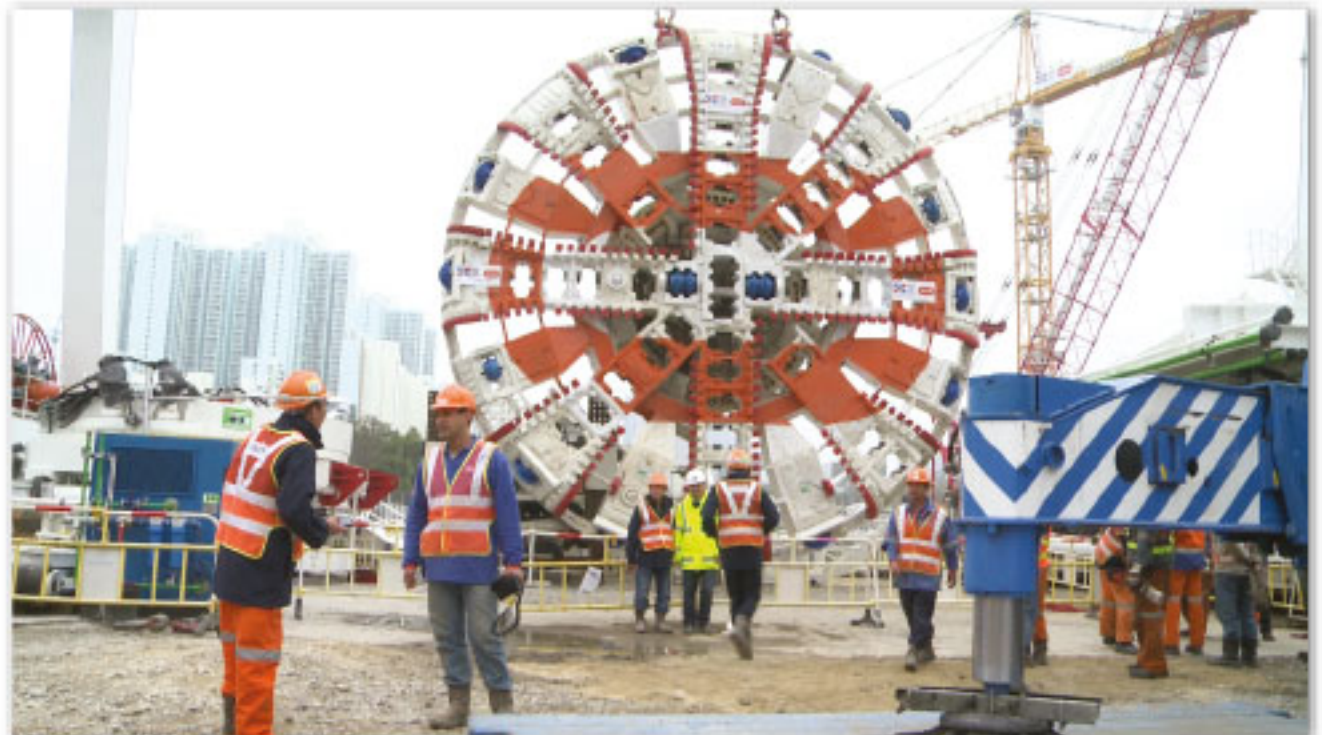
"A Dream Comes True" captured many rare scenes in construction projects. 「總有出頭天」向觀眾展現了不少難得一見的工程場面。

Only with such substantial support from the industry could we make the program a success, we must seize this opportunity to thank everyone