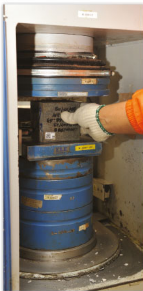
Compressive strength of concrete cube 混凝土試磚測試

供的服務須於建築工地進行。這些依賴操作員在建築工地進行的測試亦需與在實驗室進行時提供同等的服務水平。為了加強對工地測試的監督和收緊對建築材料測試