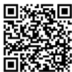
CIC R&D Fund