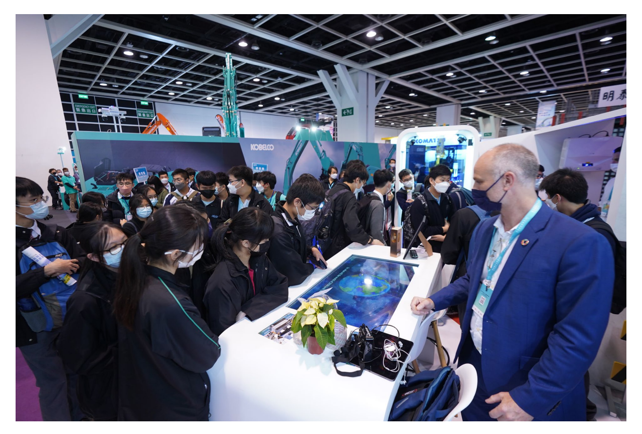
The CIExpo showcased a wide range of construction innovation solutions in its four thematic zones, attracting more than 11,000 visitors and students