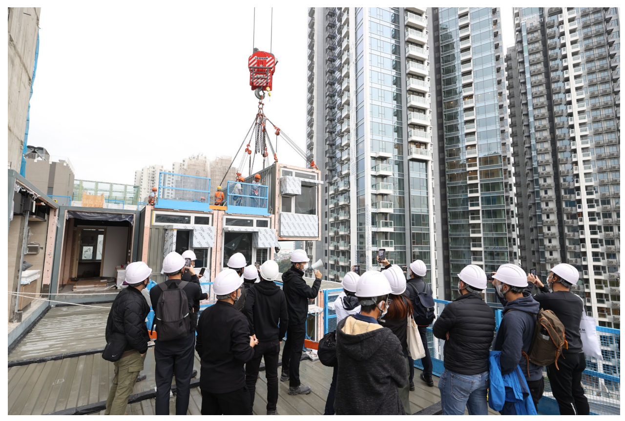
The CIExpo arranged different technical tours to present 8 successful construction projects