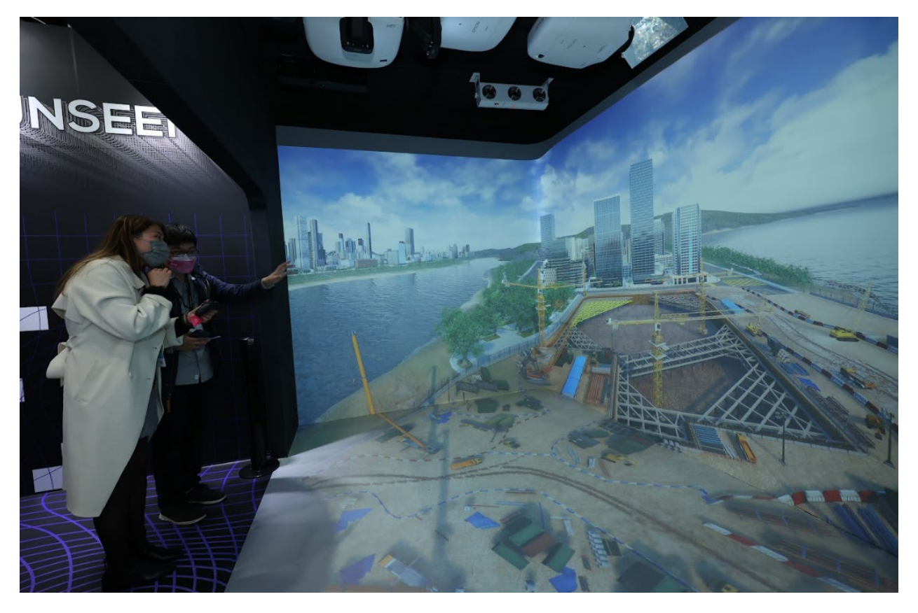
The CIExpo showcased a wide range of construction innovation solutions in its four thematic zones, namely "Industrialisation", "Digitalisation", "Automation" and "Modernisation"