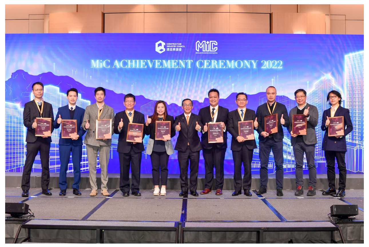
CIC awards "MiC Champions" at the MiC Achievement Ceremony