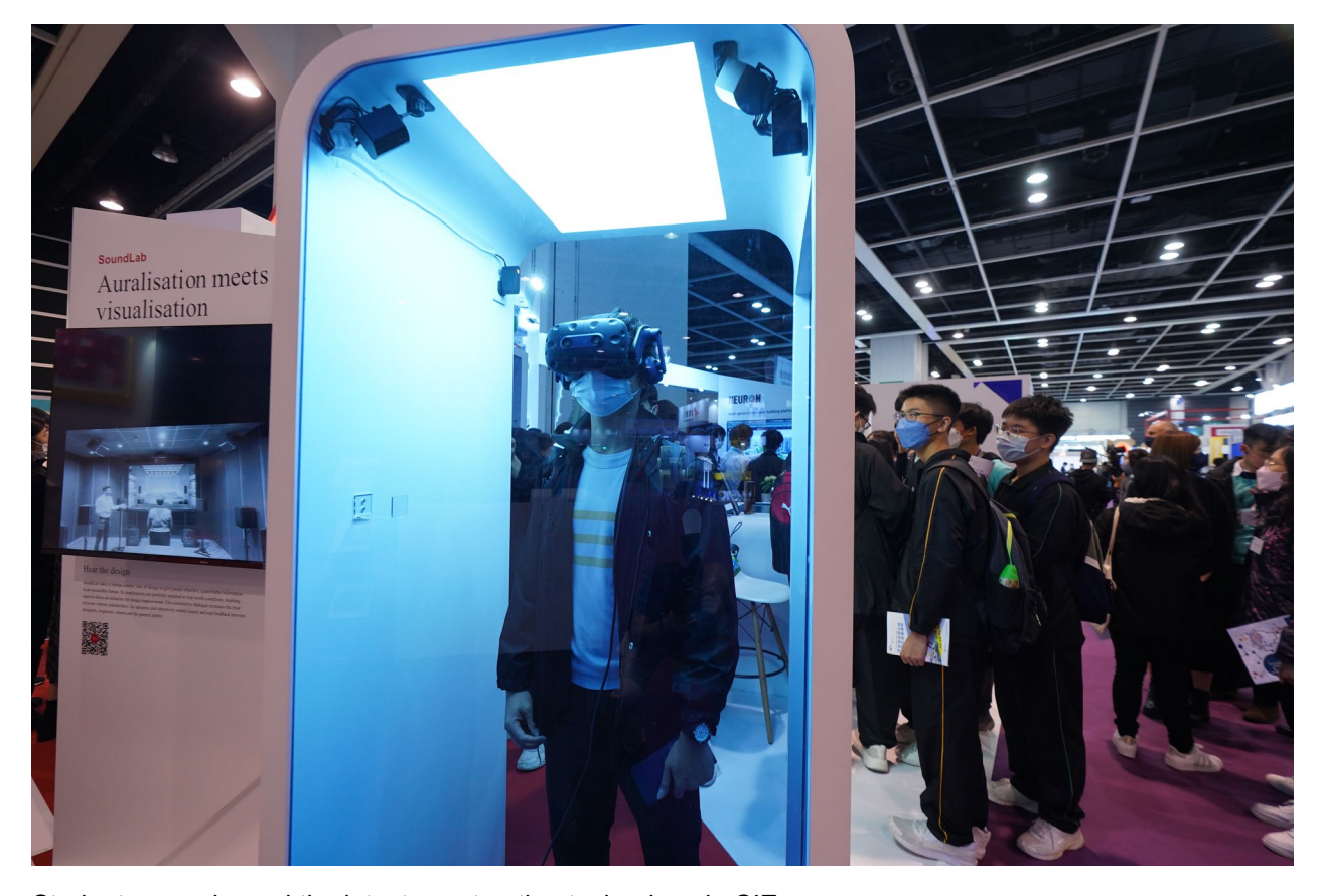
Students experienced the latest construction technology in CIExpo