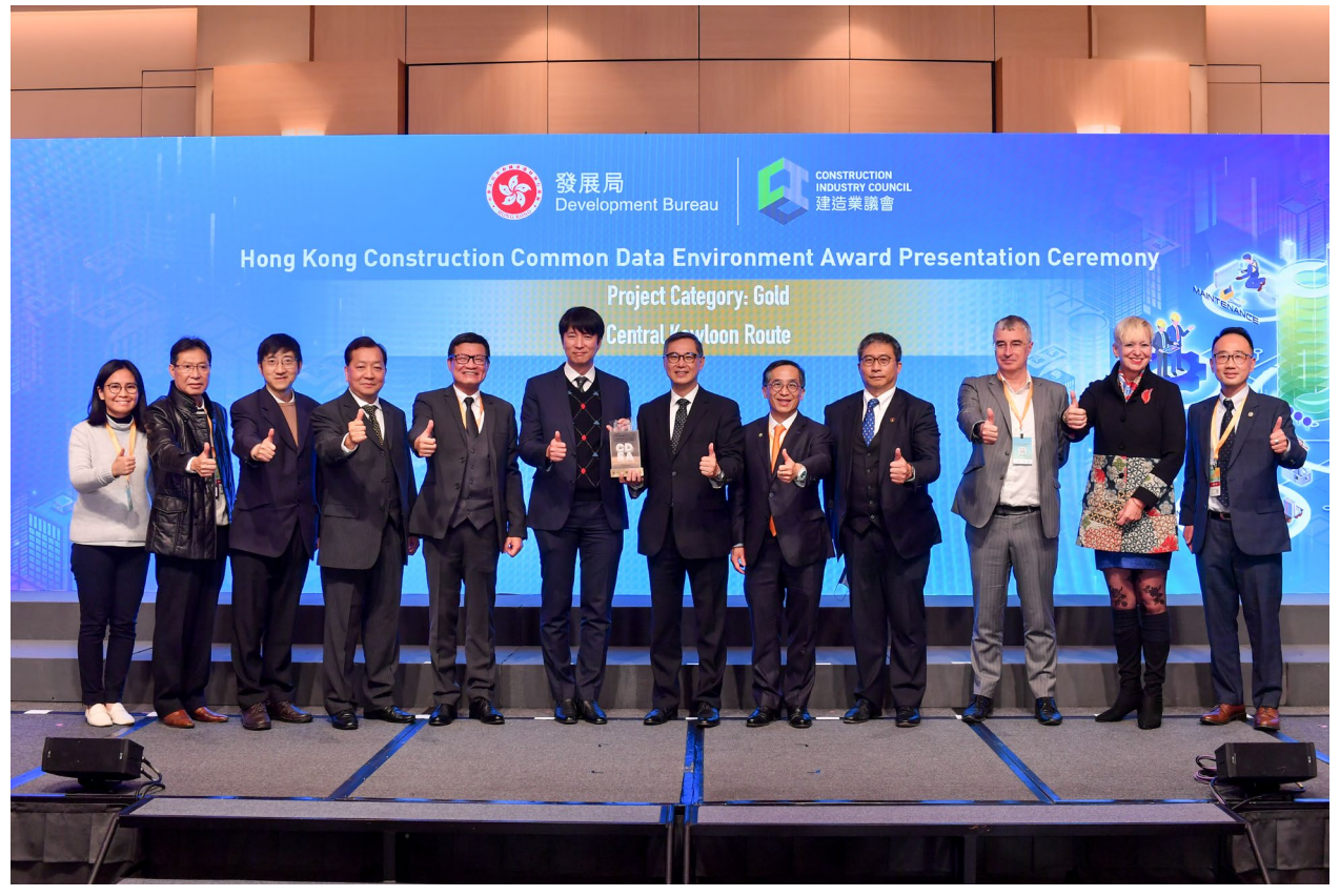
Central Kowloon Route is granted the Gold (Project Category) Award in Hong Kong Construction Common Data Environment Award