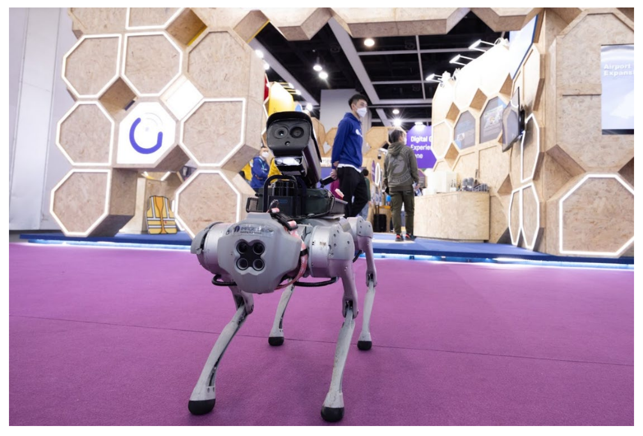
The CIExpo showcased a wide range of construction innovation solutions in its four thematic zones, namely "Industrialisation", "Digitalisation", "Automation" and "Modernisation"