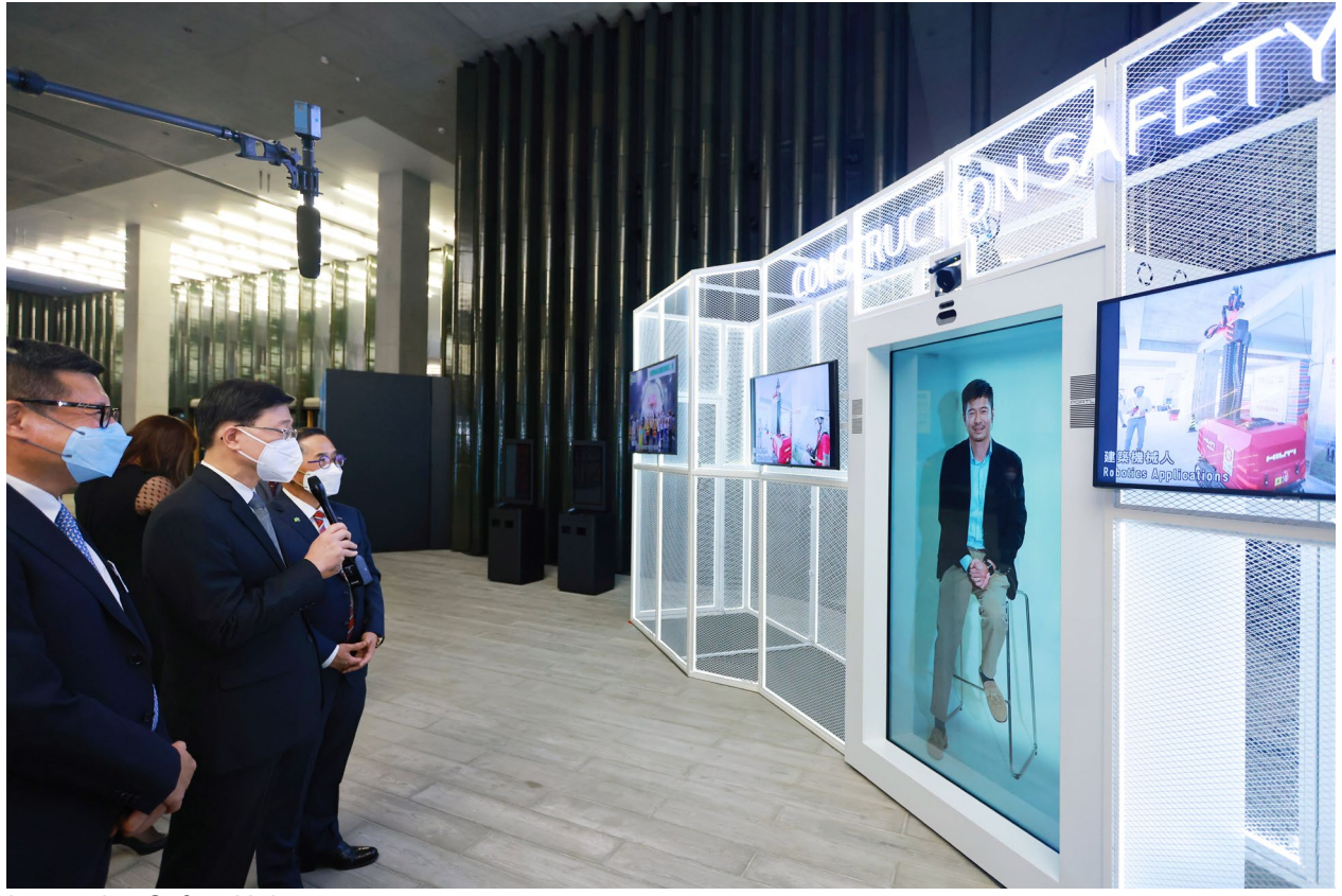
Interactive Safety Hologram