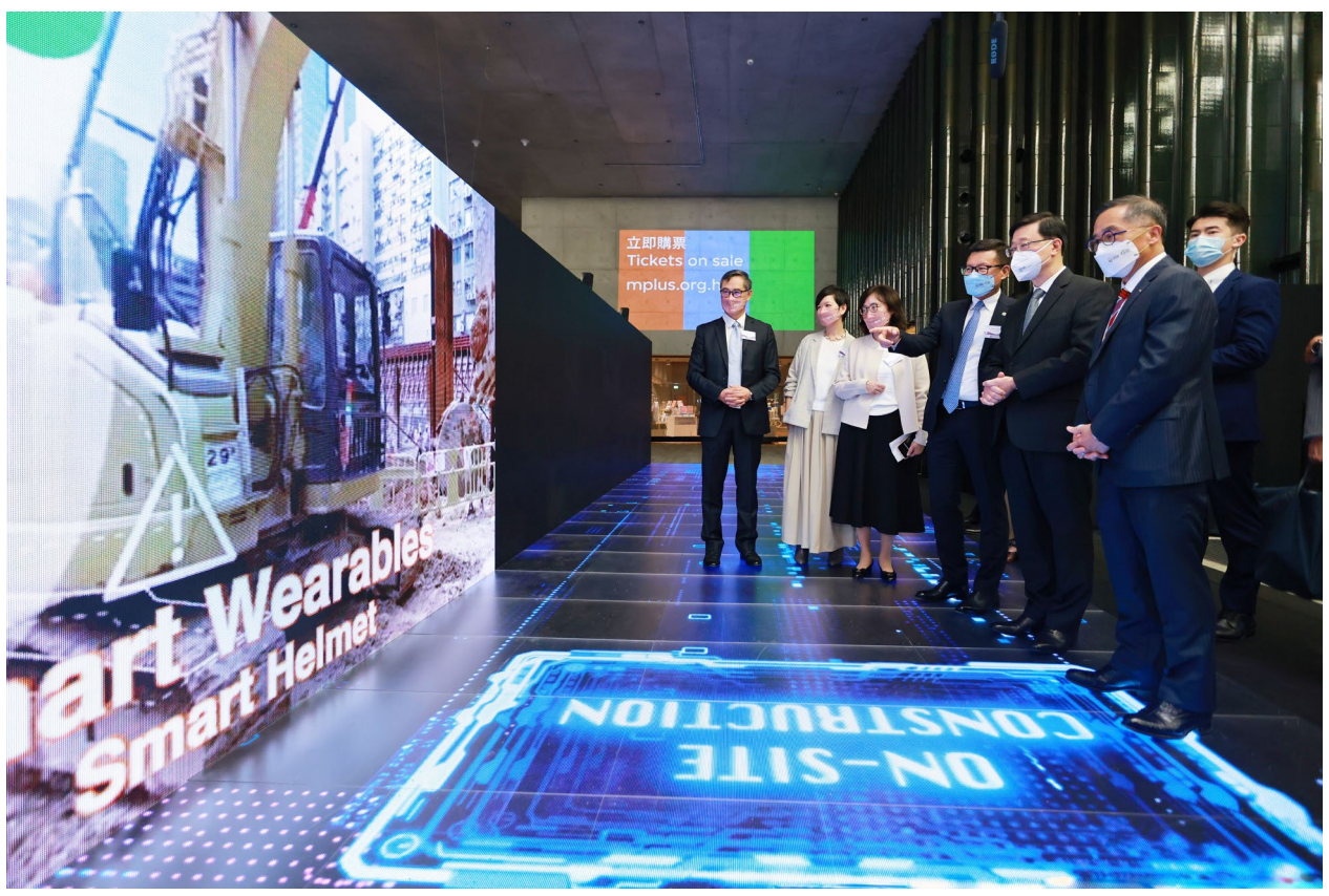
"Building ∞ Future" Digital LED Runway