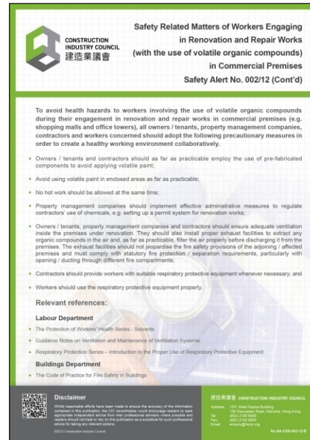
Safety Alert No. 002/12 on Safety Related Matters of Workers Engaging in Renovation and Repair Works (with the use of volatile organic compounds) in Commercial Premises