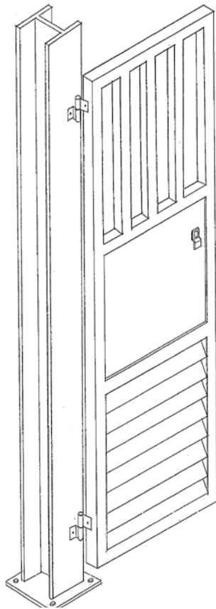
Trade Test Position (Metal Paint Spray) Perspective Drawing