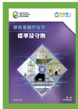
Standard and Guide on Scaffolding Safety (Chinese Version Only)