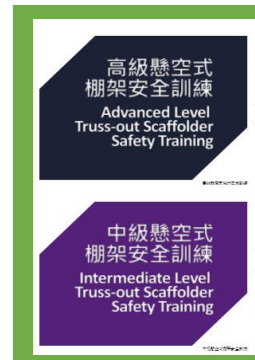
Construction Industry Council Webpage - Truss-out Scaffolder Safety Training