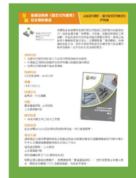
Hong Kong Institute of Construction Webpage - Certificate in Safety Enhancement for Erection and Dismantling "Truss-out Bamboo Scaffolds" (Chinese Version Only)