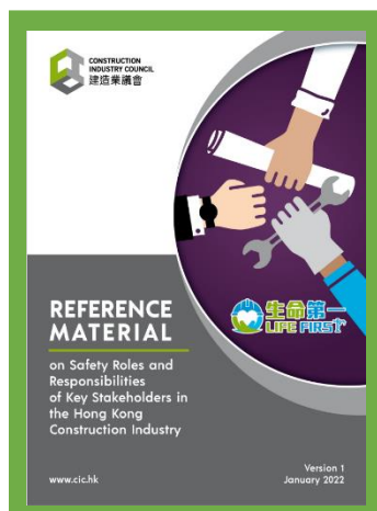
Reference Material on Safety Roles and Responsibilities of Key Stakeholders in the Hong Kong Construction Industry