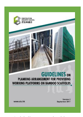
Guidelines on Planking Arrangement for Providing Working Platforms on Bamboo Scaffolds