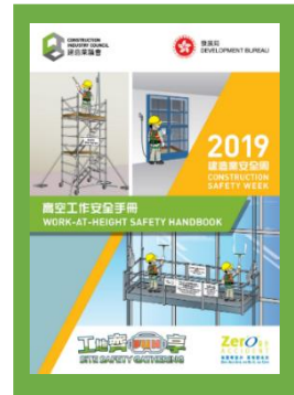
Work-At-Height Safety Handbook