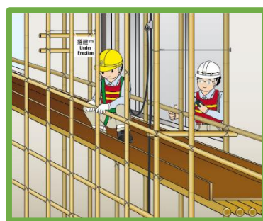
Worker wears a full body safety harness with its lanyard attached to a secure anchorage (e.g. an eye bolt) or an independent lifeline with a fall arrester