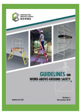
Guidelines on Workabove-ground Safety