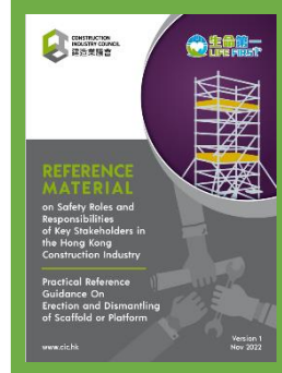
Reference Material on Safety Roles and Responsibilities of Key Stakeholders in the Hong Kong Construction Industry (Practical Reference Guidance On Erection and Dismantling of Scaffold or Platform)