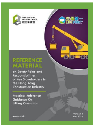
Reference Material on Safety Roles and Responsibilities of Key Stakeholders in the Hong Kong Construction Industry (Practical Reference Guidance On Lifting Operation)