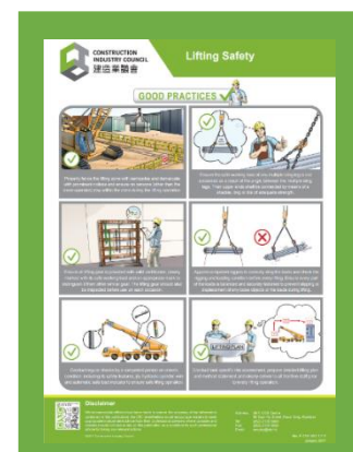
Poster - Lifting Safety