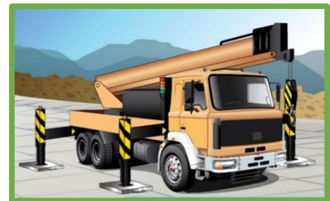
A crane shall be operated on a firm and level ground that can adequately support the weight of the crane and loads