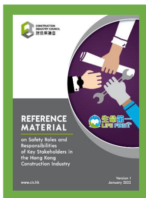
Reference Material on Safety Roles and Responsibilities of Key Stakeholders in the Hong Kong Construction Industry