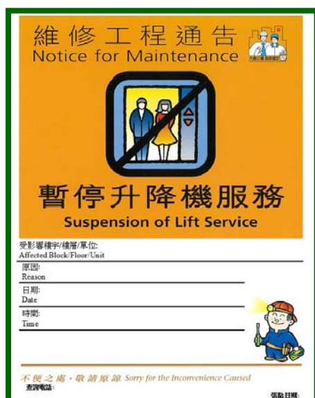
Figure 14 (9.2.3):

Proper warning notices warning that the lift is out of service should also be posted at prominent positions