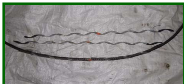
Figure 16(9.2.15): Reeving Splice

9.2.15 Regarding the use of “reeving splice”, the weight of the new wire rope and the maximum permissible weight to be suspended by the “reeving splice” should be taken into account in planning the operation with