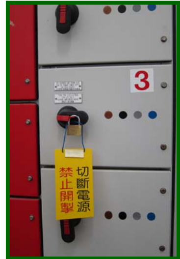
Figure 9(8.5.3c): Source of electrical energy to be properly isolated with lockout/ tagout