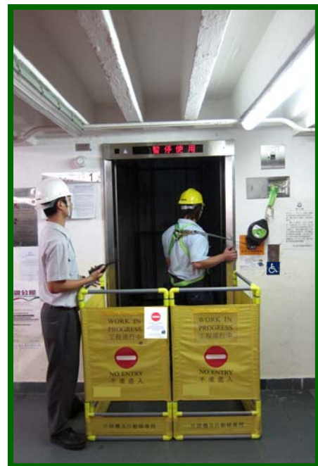
Figure 1(8.2.1e): Safe access to and egress from the lift shaft openings should be provided

(g) Suitable barriers with warning signs should be erected in front of the landing doors of the lowest floor and inside the lift car to prevent any person from getting close to the working area, falling into the lift pit or entering the lift car;