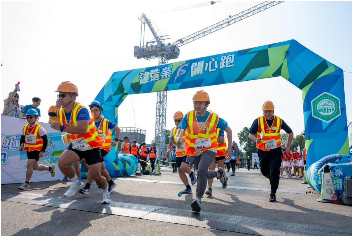
Participants of the 'Construction Style Relay' dress in construction-related costumes

CONSTRUCTION INDUSTRY SPORTS & VOLUNTEERING PROGRAMME 建造業運動及義工計劃