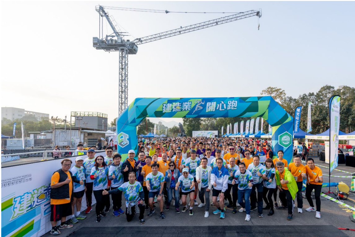
Participants of the 10 km race are set and ready