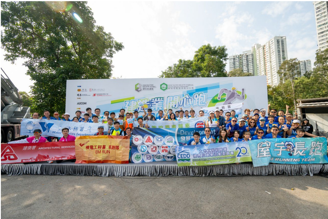
Development Bureau won both the 'Perseverant Organisation Award' and "Team Spirit Award"