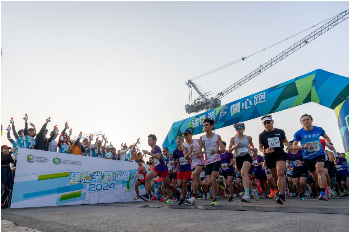
Distinguished guests sound the starting horns to set off the race