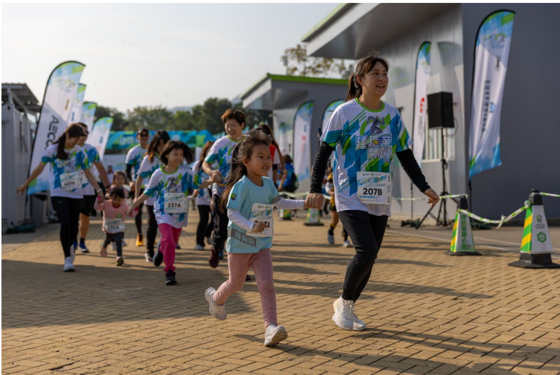
The 'Parent-and-Child Race' attracts many families to participate