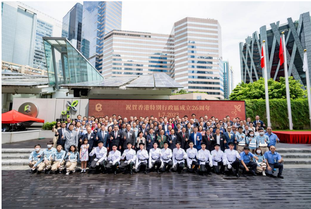
Over 100 distinguished guests gather to celebrate the 26th anniversary of Hong Kong's return to the motherland