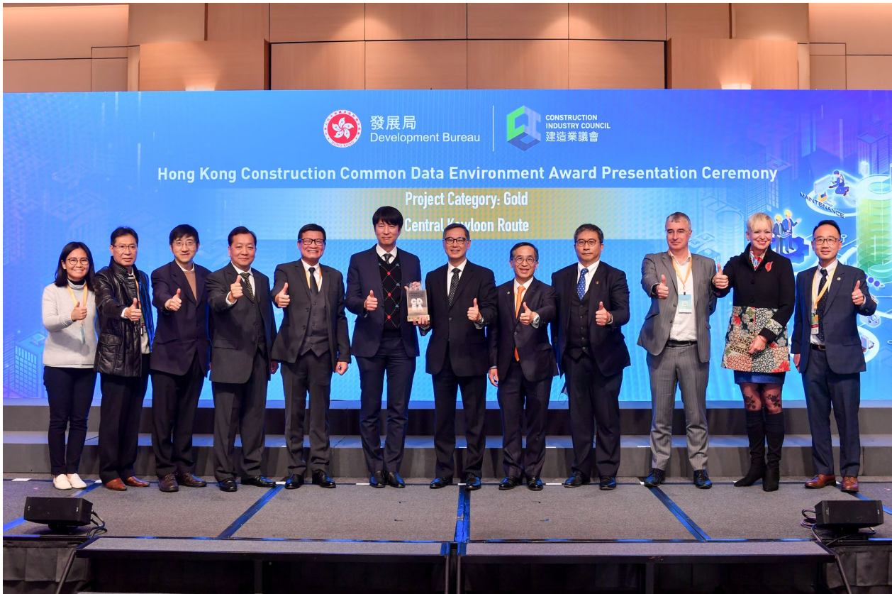
Central Kowloon Route is granted the Gold (Project Category) Award in Hong Kong Construction Common Data Environment Award