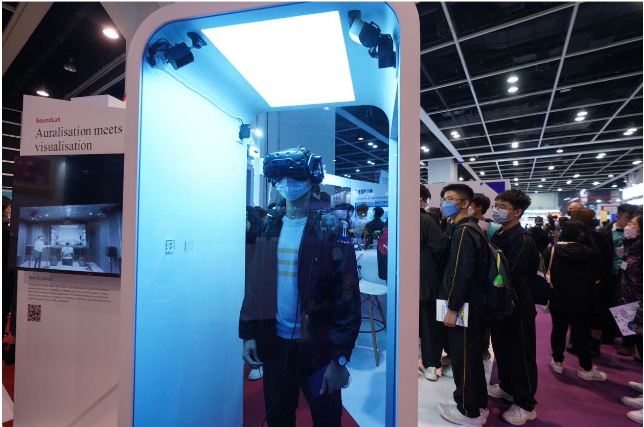
Students experienced the latest construction technology in CIExpo