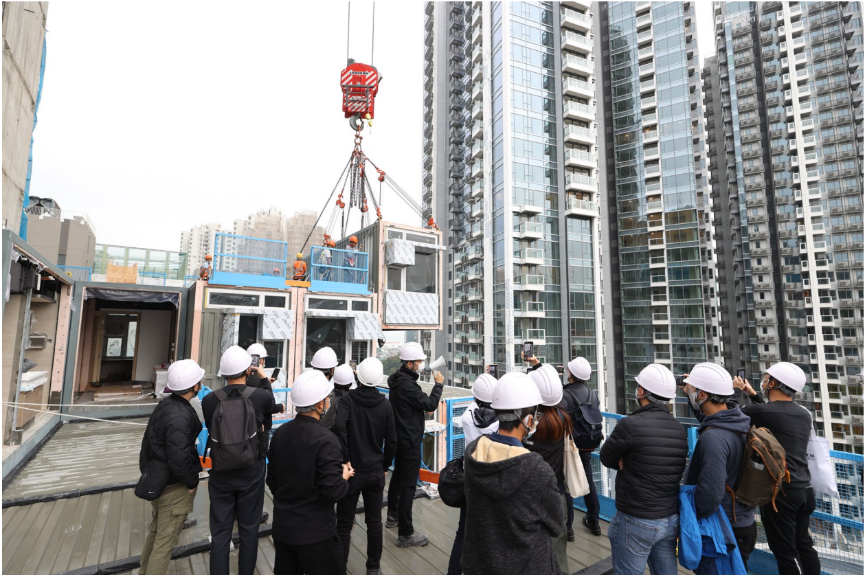
The CIExpo arranged different technical tours to present 8 successful construction projects