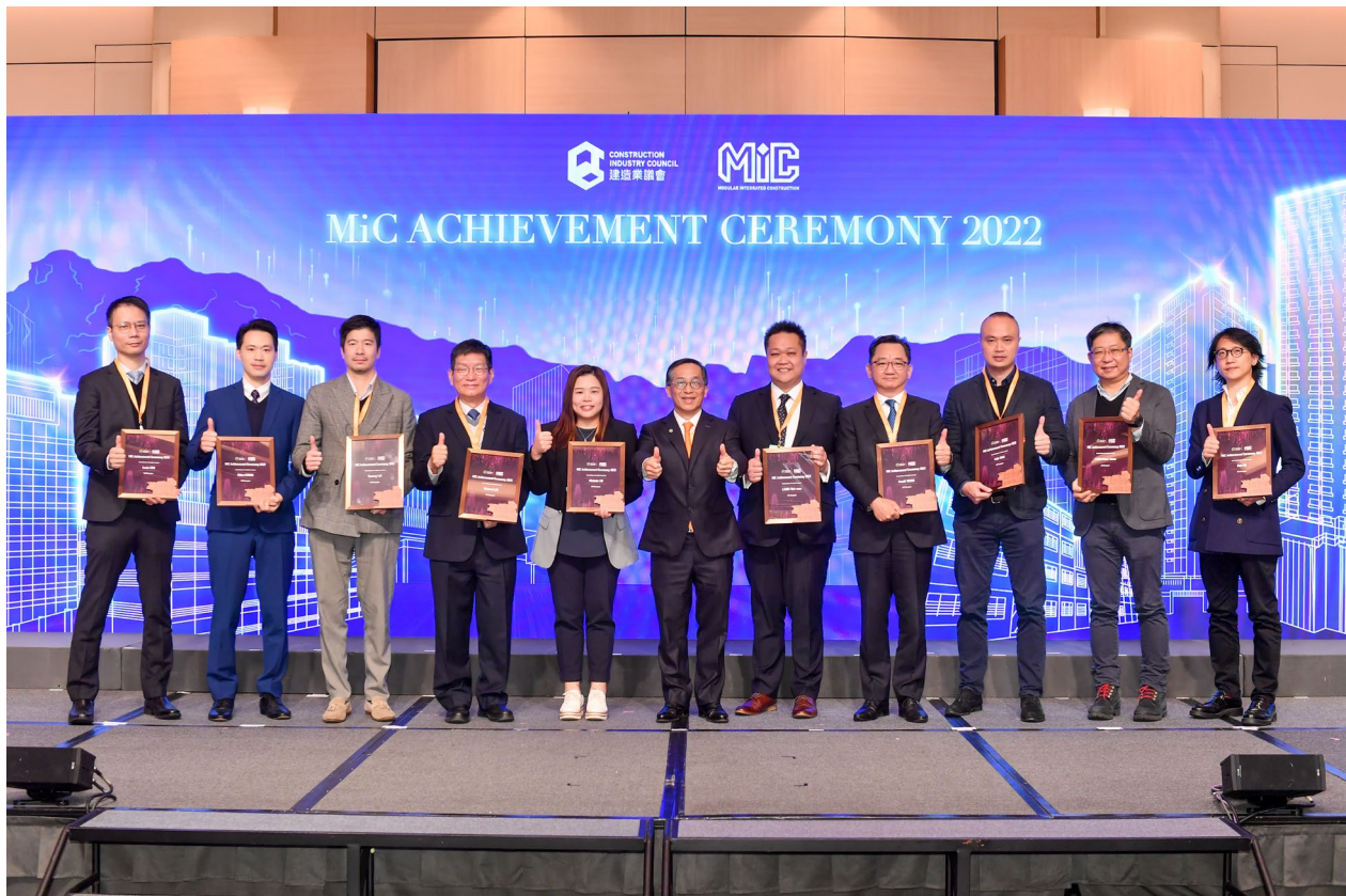
CIC awards "MiC Champions" at the MiC Achievement Ceremony