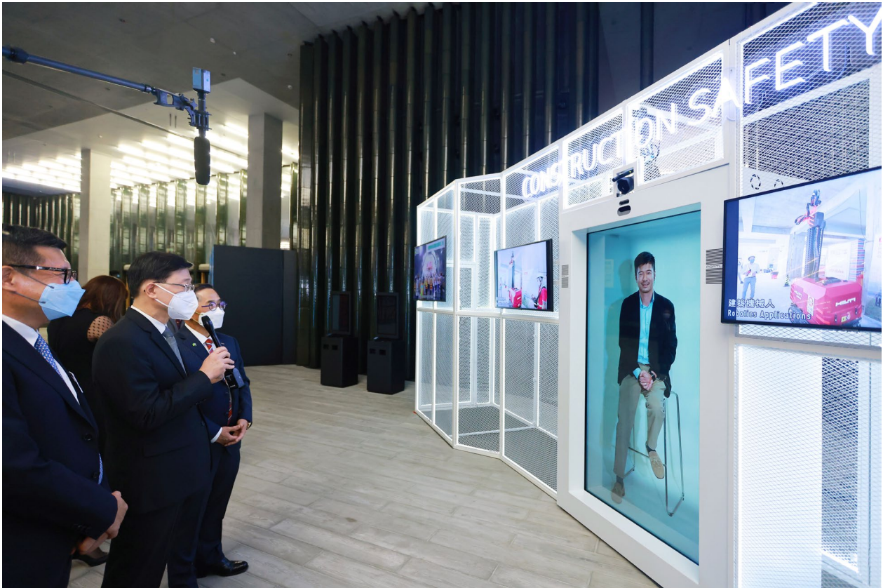
Interactive Safety Hologram