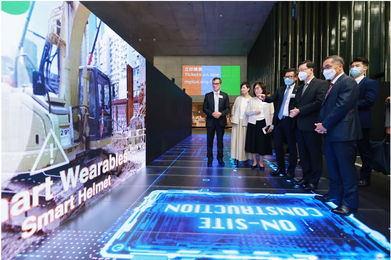
"Building ∞ Future" Digital LED Runway

Construction Industry Council 38/F, COS Centre, 56 Tsun Yip Street, Kwun Tong, Kowloon, Hong Kong Tel: (852) 2100 9000 | Fax: (852) 2100 9090 | Email: enquiry@cic.hk | Website: www.cic.hk