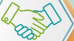
誠信管理 Integrity Management

註冊續期申請必須提交高級管理人員誠信培訓記錄 Submit integrity training records of senior management staff for renewal application