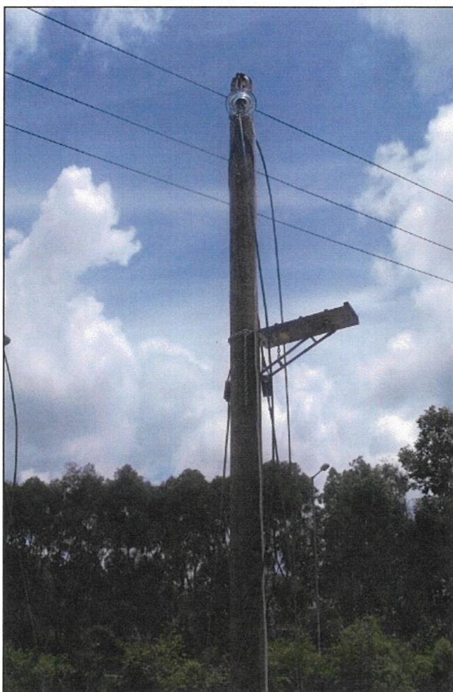
( Reference image )