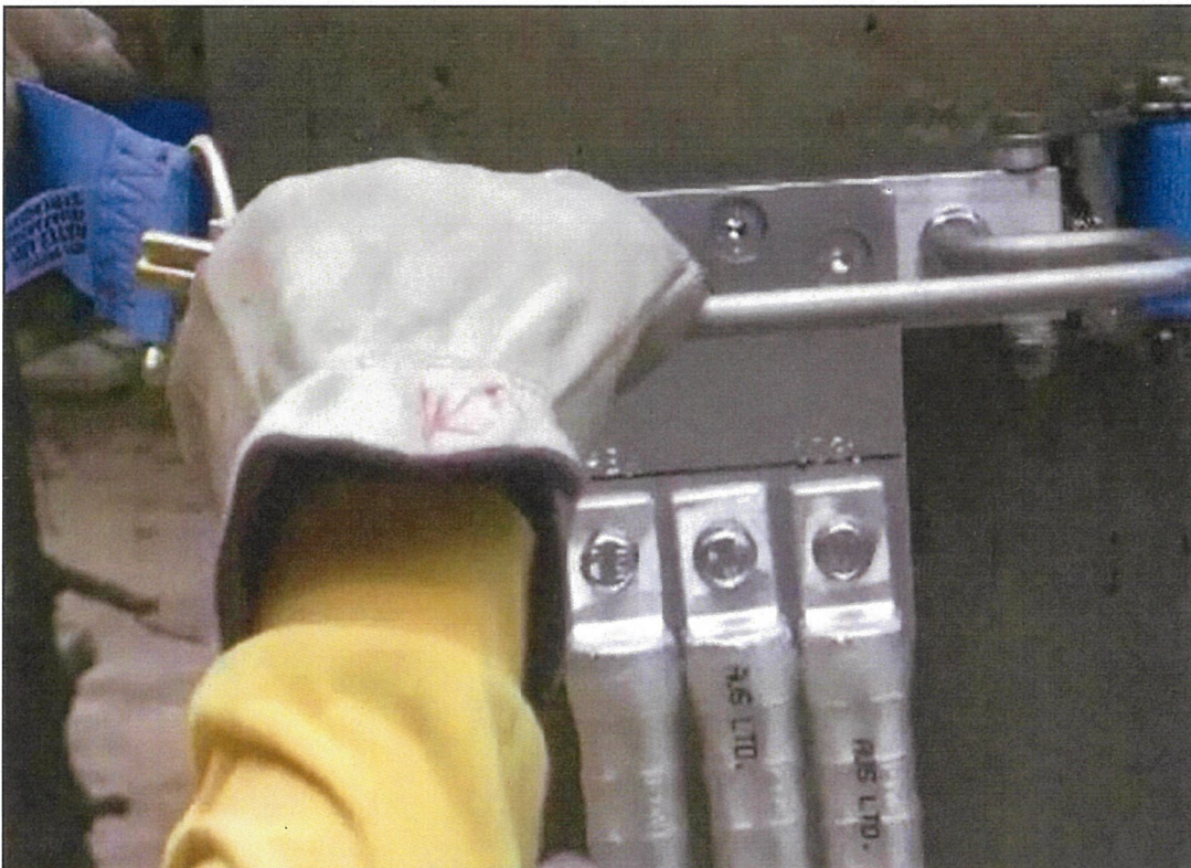
( Reference image )