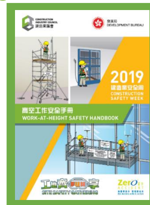
Work-At-Height Safety Handbook