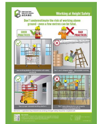
Poster - Working at Height Safety