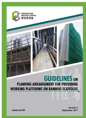
Guidelines on Planking Arrangement for Providing Working Platforms on Bamboo Scaffolds