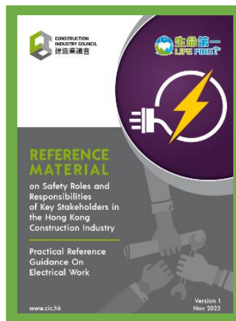
Reference Material on Safety Roles and Responsibilities of Key Stakeholders in the Hong Kong Construction Industry (Practical Reference Guidance On Electrical Work)