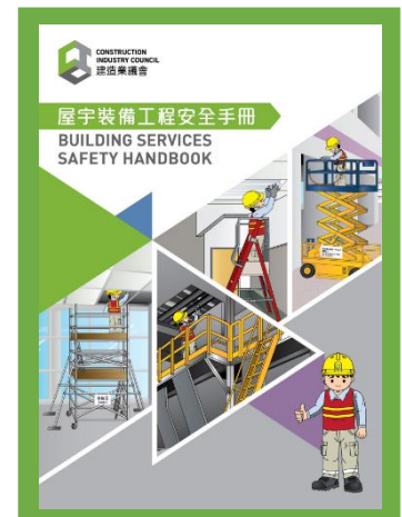
Building Services Safety Handbook