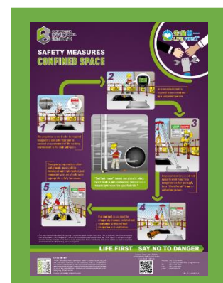
Poster Safety Measures - Confined Space