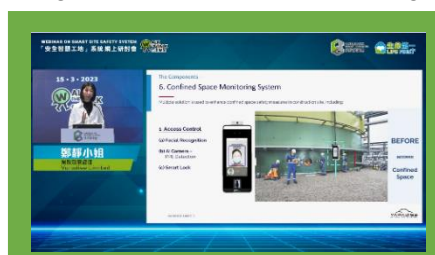
Life First – Walk the Talk – Smart Site Safety System was held on 15 Mar 2023. Please watch replay of the Webinar at CIC website