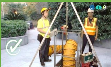
Please refer to the Safety Video – Confined Space Works at CIC website