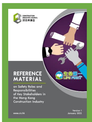
Reference Material on Safety Roles and Responsibilities of Key Stakeholders in the Hong Kong Construction Industry