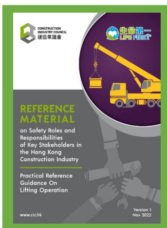
Reference Material - on Safety Roles and Responsibilities of Key Stakeholders in the Hong Kong Construction Industry (Practical Reference Guidance On Lifting Operation)