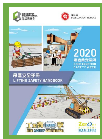
Lifting Safety Handbook