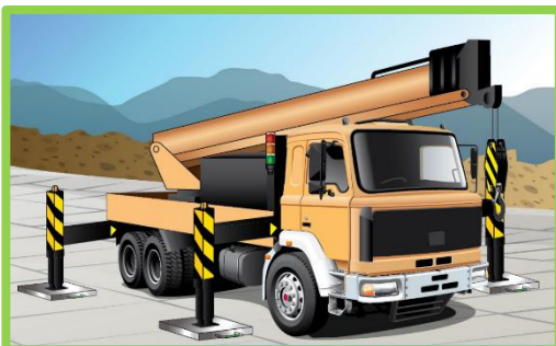
Mobile crane shall be operated on a firm and level ground that can adequately support the weight of the crane and loads