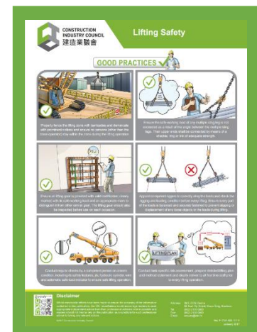
Poster - Lifting Safety