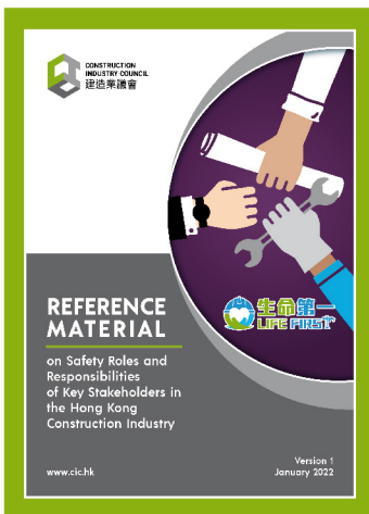
Reference Material on Safety Roles and Responsibilities of Key Stakeholders in the Hong Kong Construction Industry