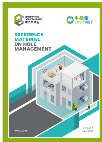
Reference Material on Hole Management