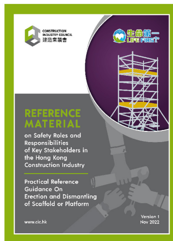
Reference Material on Safety Roles and Responsibilities of Key Stakeholders in the Hong Kong Construction Industry (Practical Reference Guidance On Erection and Dismantling of Scaffold or Platform)