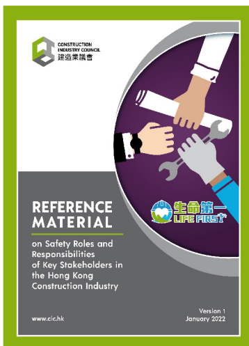
Reference Material on Safety Roles and Responsibilities of Key Stakeholders in the Hong Kong Construction Industry