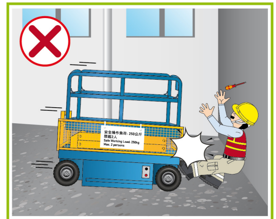
Do not park EWP on the slope