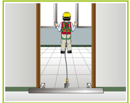
Transportable temporary anchor device