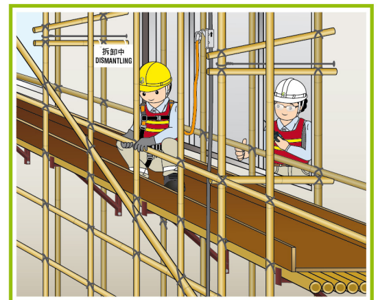
Under supervision by competent person.