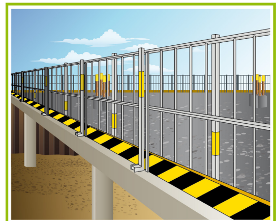
Provide guard-rails and toe-boards at the floor edge.

The above only listed out key points of safety, for more information please make reference to the Construction Site (Safety) Regulations , the Guidance Notes on Classification and Use of Safety Belts and their Anchorage Systems issued by the Labour Department and Work-at-Height Safety Handbook issued by the CIC.