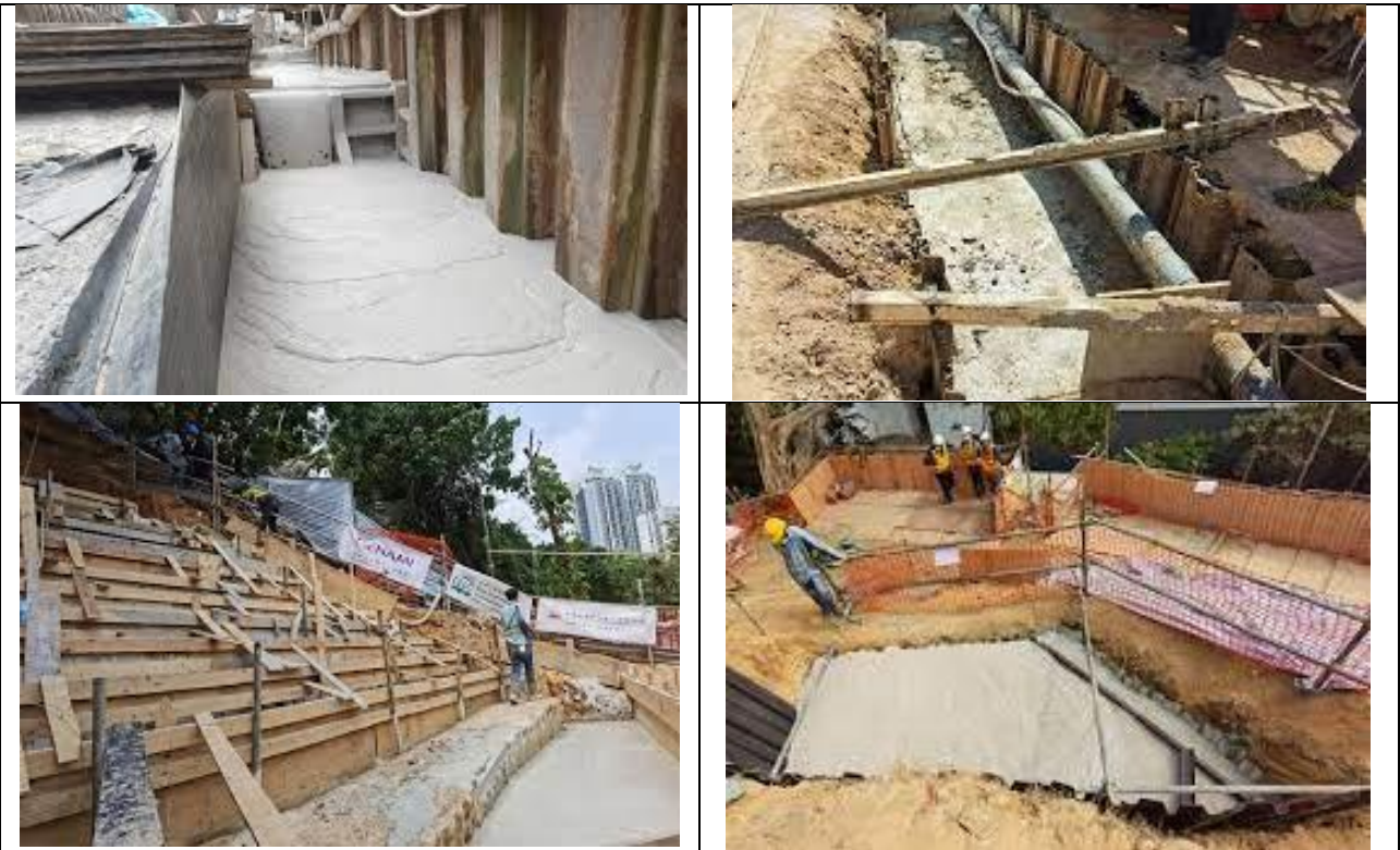
(a) Self-Compacting Backfill Material System (CITF No. PA21-015) Golik Concrete Limited / Minji Limited / Vast Hill Development Limited Tel: 2634 1818 / 9144 3497 / 6377 1213