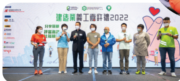
Representatives share experiences at the Construction Industry Volunteer Award Presentation Ceremony 2022