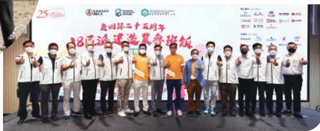
“18 Districts Lo Pan Rice” Campaign