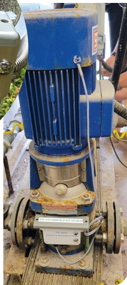
Vibration and Temperature Sensor