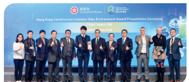
Hong Kong Construction Common Data Environment Award

The CIC and the Development Bureau co-organised the first ever “Hong Kong Construction Common Data Environment Award” to recognise outstanding local projects and organisations that had best utilised Common Data Environment (CDE) to improve project management, collaboration and productivity. A total of 11 awards were given under Project and Organisation categories.