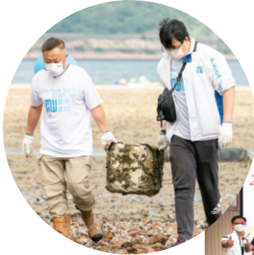
Lo Pan Service Month – Construction Industry Shoreline Clean-up Day