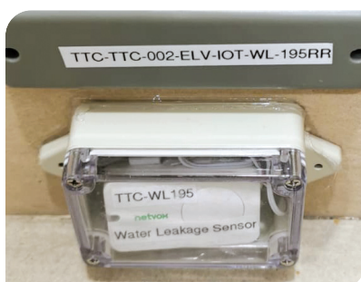
Water Leakage Sensor (Point Type)