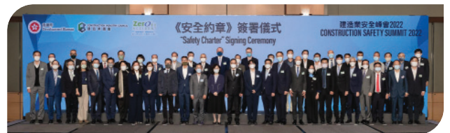
Construction Safety Summit 2022 “Safety Charter” Signing Ceremony