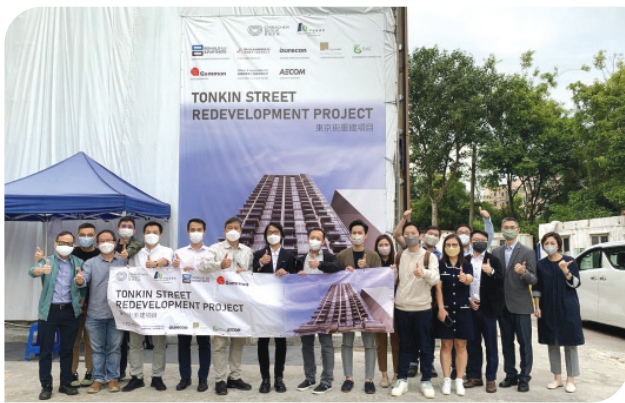
Mockup for Tonkin Street Redevelopment Project visit

As an advocate of MiC in Hong Kong, the CIC strives to promote understanding on the MiC construction process in the industry, including how to achieve greener buildings. The CIC organised local site visits in 2022 for Joint Working Group on MiC, CITF Vetting Sub-committees, developers and master class students. Projects included Mockup for Tonkin Street Redevelopment Project, MiC Mockup for Hung Shui Kiu Phase IA and Student Residence at Wong Chuk Hang for the University of Hong Kong. Over 60 participants joined these visits.