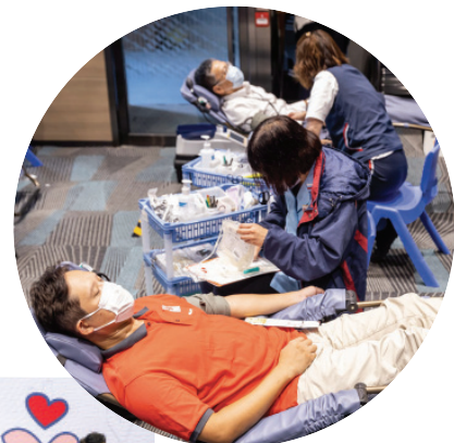
Lo Pan Service Month – Construction Industry Blood Donation Day