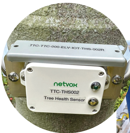
Tree Health Sensor