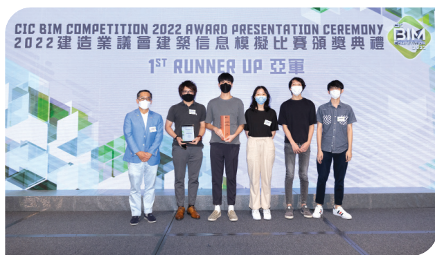
CIC BIM Competition 2022 Award Ceremony

For the fourth year, the CIC BIM Competition continued to promote the practical uses of BIM through a collaborative and competitive learning approach among higher education students in construction-related disciplines. The theme of the Competition was “Modularity & Adaptability in Transitional Housing (T-Housing) Design with Use of BIM”. This is the first time to mandate the use of CDE as one of the submission requirements for students to experience digital project coordination and collaboration using CDE.