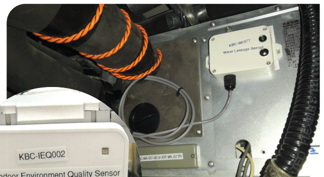
Water Leakage Sensor (Rope Type)