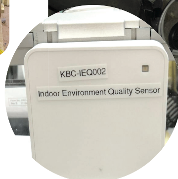
Indoor Environment Quality Sensor