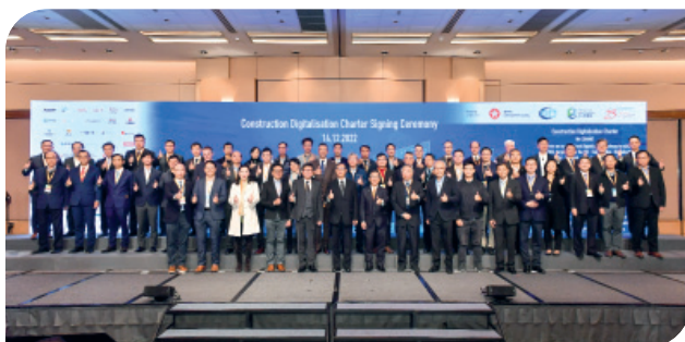
Construction Digitalisation Charter Signing Ceremony