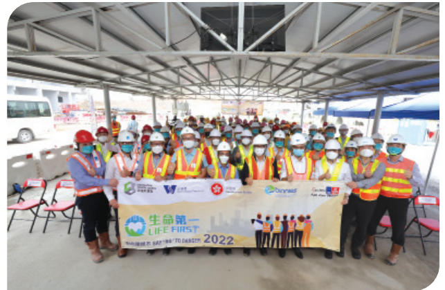
“Life First” Safety Promotion Campaign

The CIC and the Development Bureau (DEVB) co-organised the Construction Safety Summit 2022 on 4 November 2022. With the theme of revamping site safety culture, the summit pooled more than 100 representatives and experts of the industry together to discuss a number of construction safety issues and they also signed the “Safety Charter” at the Summit, pledging to drive changes to the construction safety culture, to map out the four directions of action plan that can uplift the overall safety performance of the industry so as to achieve the vision of “zero accidents”. Besides, about 10,000 industry stakeholders participated in the Summit via online live broadcast.