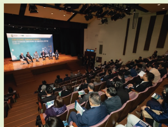
聯盟論壇 Alliance Forums