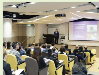
研討會及工作坊 Technical Seminars & Workshops