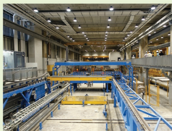
技術參觀 Technical Visits