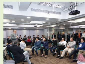
專題分會 Focus Hubs