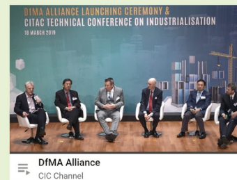
網上知識共享平台 Online Knowledge Sharing Platform