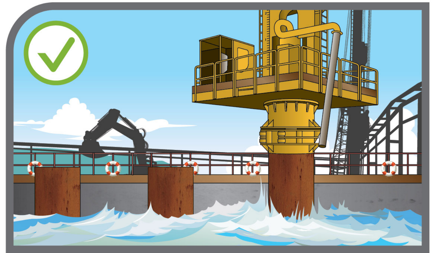
Suitable working platforms, guard-rails and toe-boards shall be provided to machinery used over water.