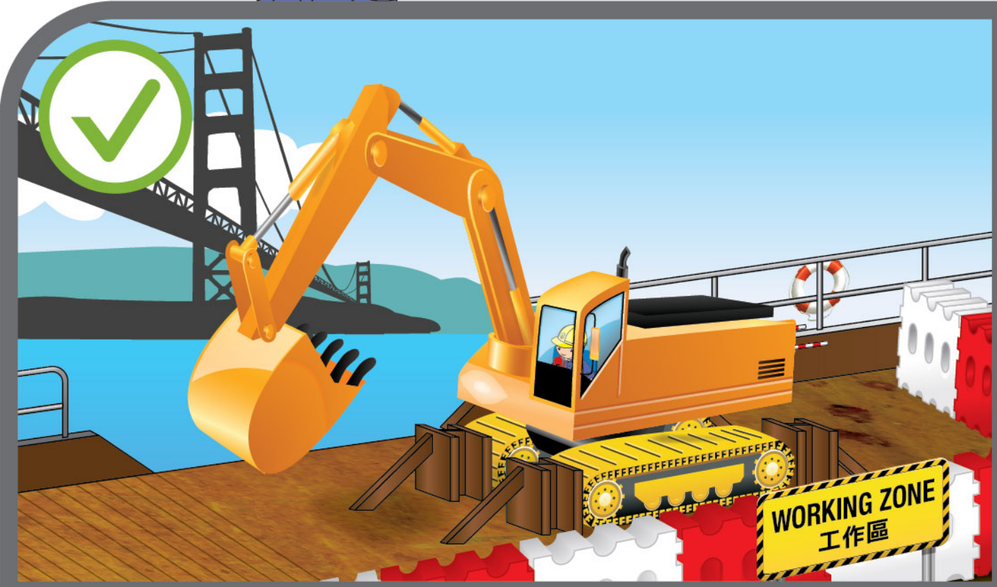
Excavator and other lifting appliances on vessel shall be secured to a fixed location.

Lifting appliances and lifting gear shall be inspected, tested and examined thoroughly before use. Keep away from working zone.