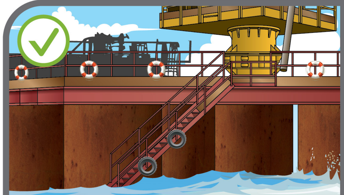
Working platforms over water shall be provided with proper guard-rails, toe-boards, safe access and egress and suitable rescue equipment.