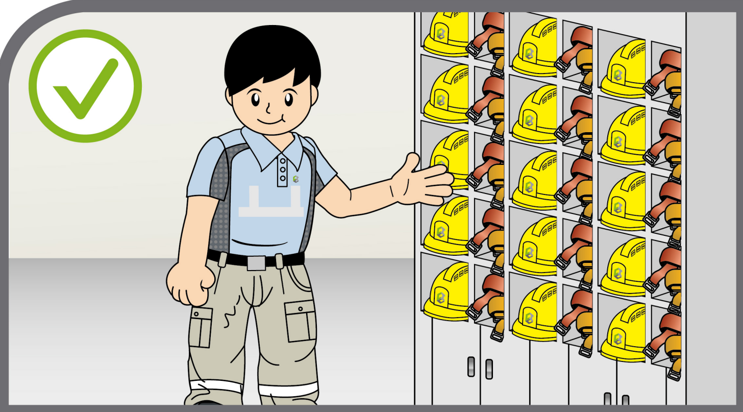
Store safety helmets properly and avoid storing at places with direct sunlight.