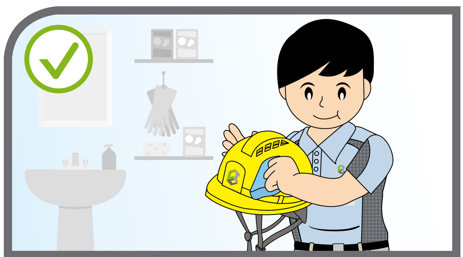
Inspect and clean safety helmets regularly.