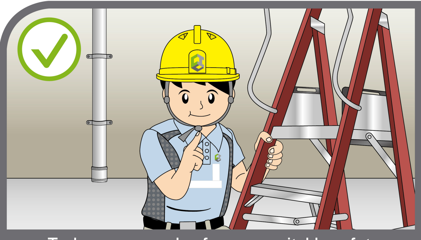
To be secure and safe, wear suitable safety helmets with chin straps.