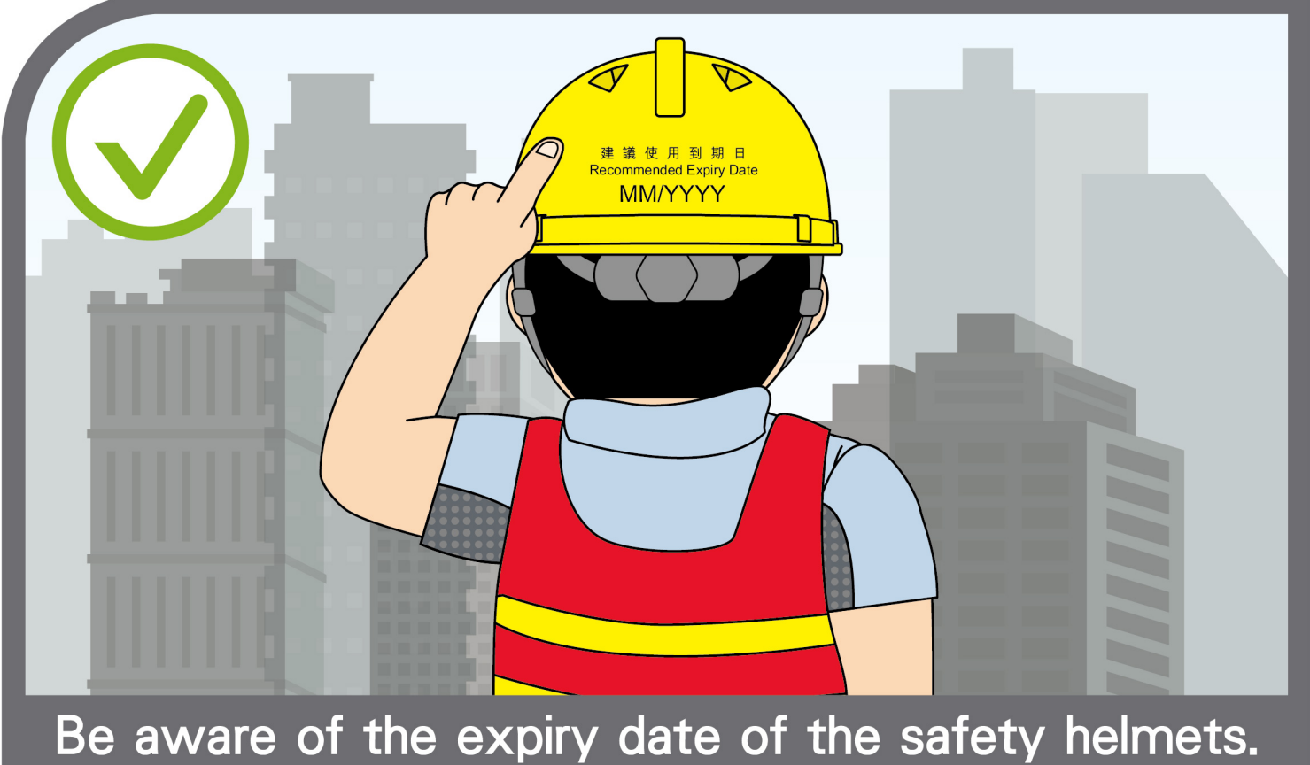
Be aware of the expiry date of the safety helmets. Do not wear safety helmets that have already expired.

Choose safety helmets conforming to international/national standards.